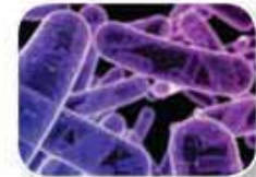
Balance Bacteria Levels